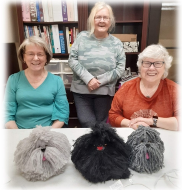
"Yarn Puppies" were so fun on Wednesday Craft Day!

THE NIKISKI SENIOR CENTER WILL BE CLOSED MONDAY, FEBRUARY 21, 2022